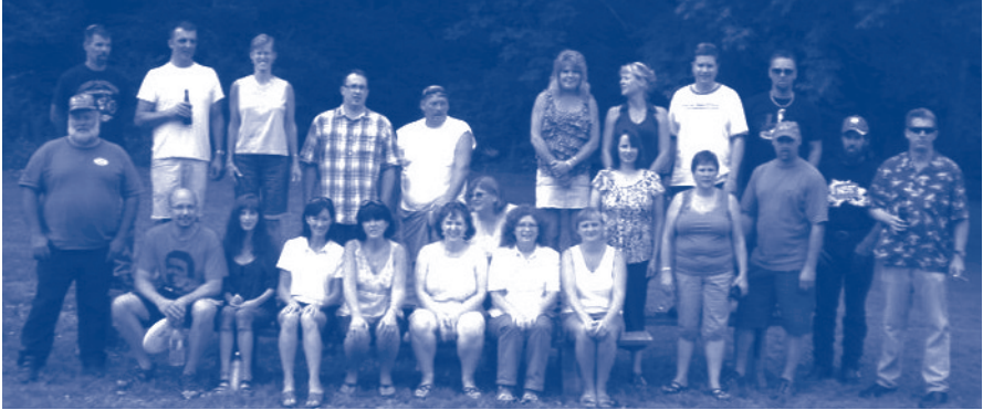
Class of 1985