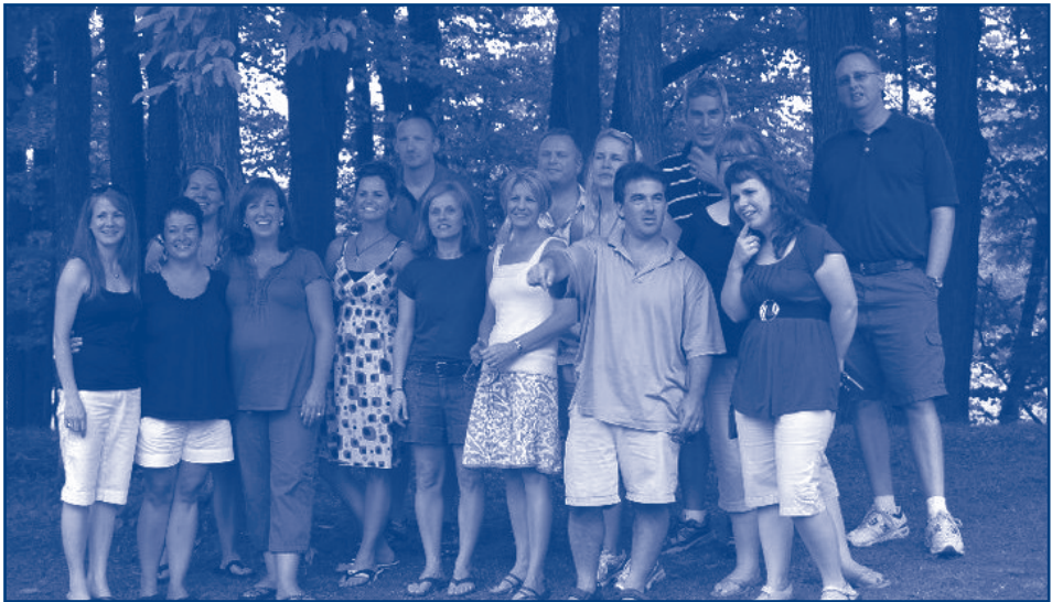
Class of 1990