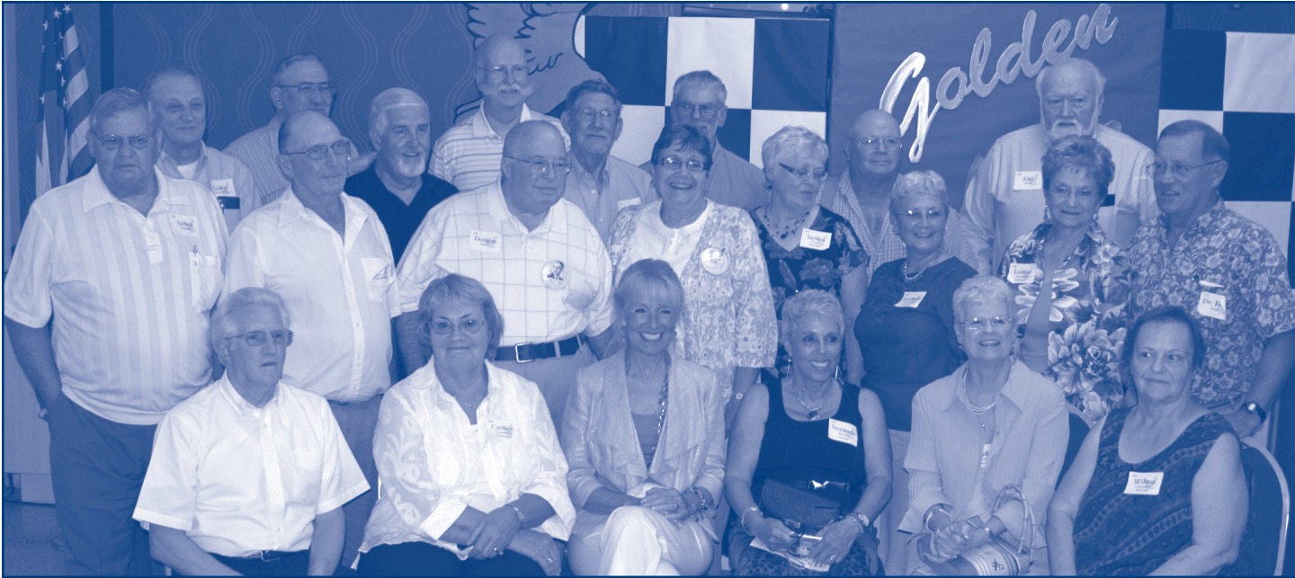
Class of 1960 at Alumni Reunion July 24, 2010

The Terra Cotta Coffeehouse in Alfred was the setting for a brunch for those returning from the Class of 1955.