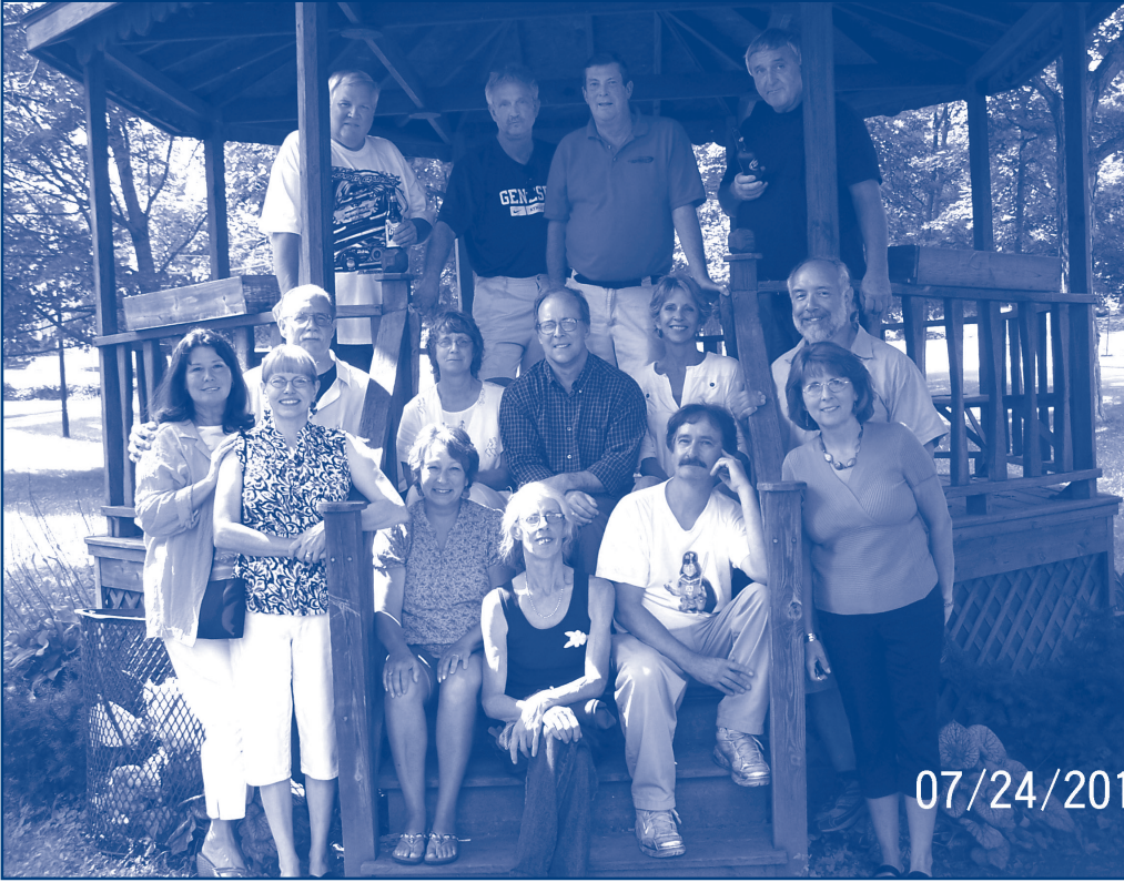
Class of 1970

Growing up in Almond and attending Alfred-Almond, it isn't strange at all to go to the alumni banquet on Saturday evening and see someone you know five to ten years older or younger than you there. One of the great things about small-town USA, the A-A alumni banquet in particular and perhaps life in general. Having your class as one of the honored